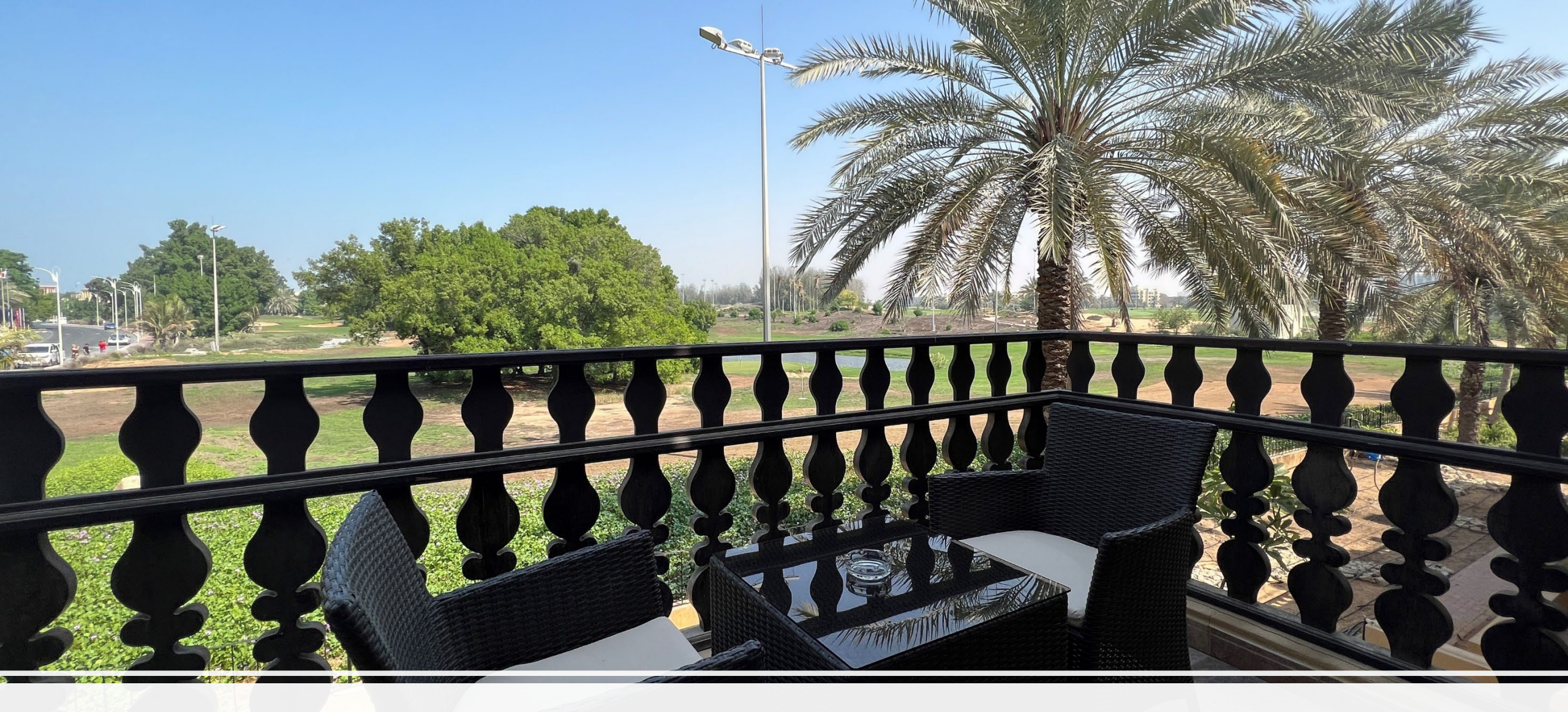
Classic Room with the Balcony