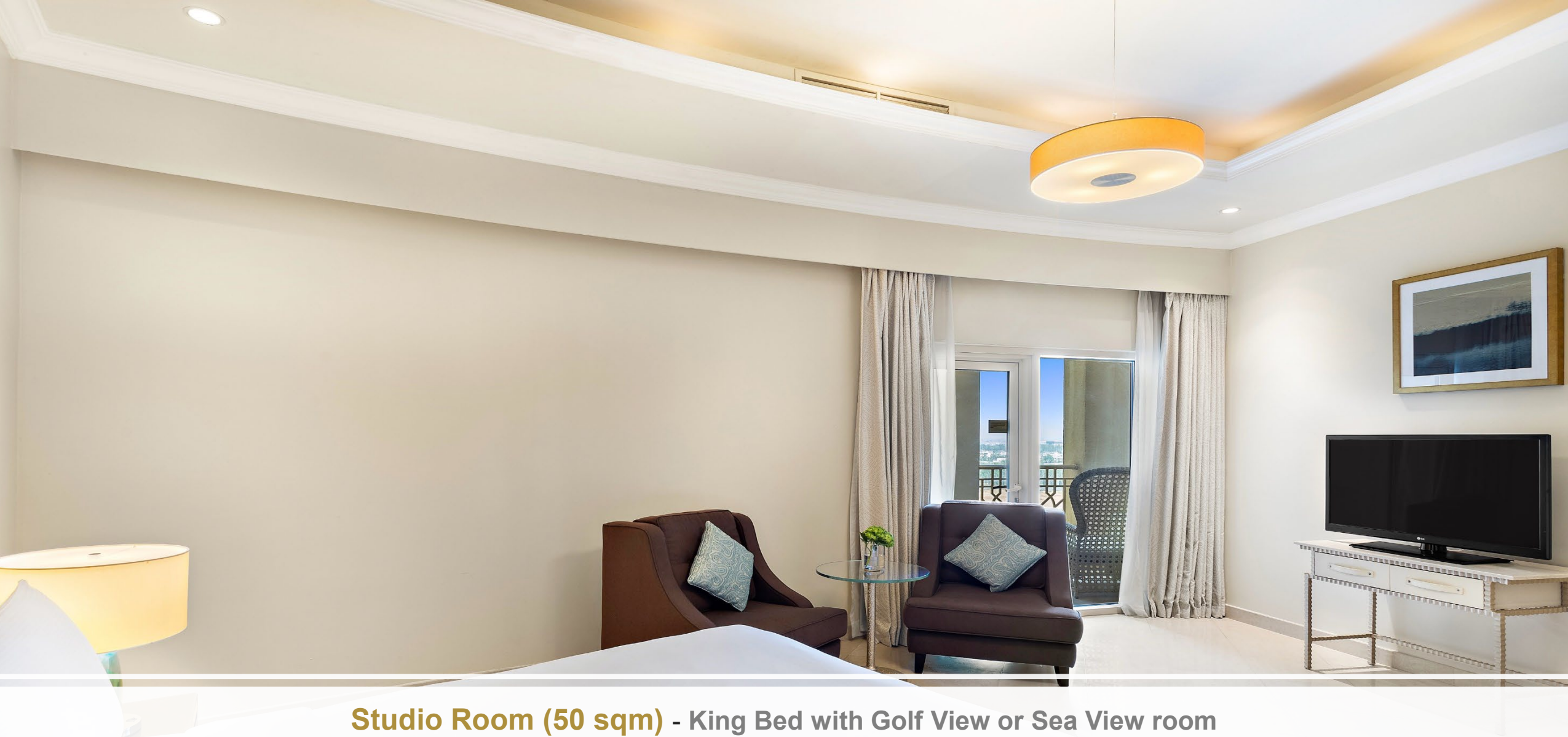
Studio Room (50 sqm) - King Bed with Golf View or Sea View room One Extra Bed can be added with maximum occupancy: 3 adults or 2 adults + 2 children (free on parents' meal plan).