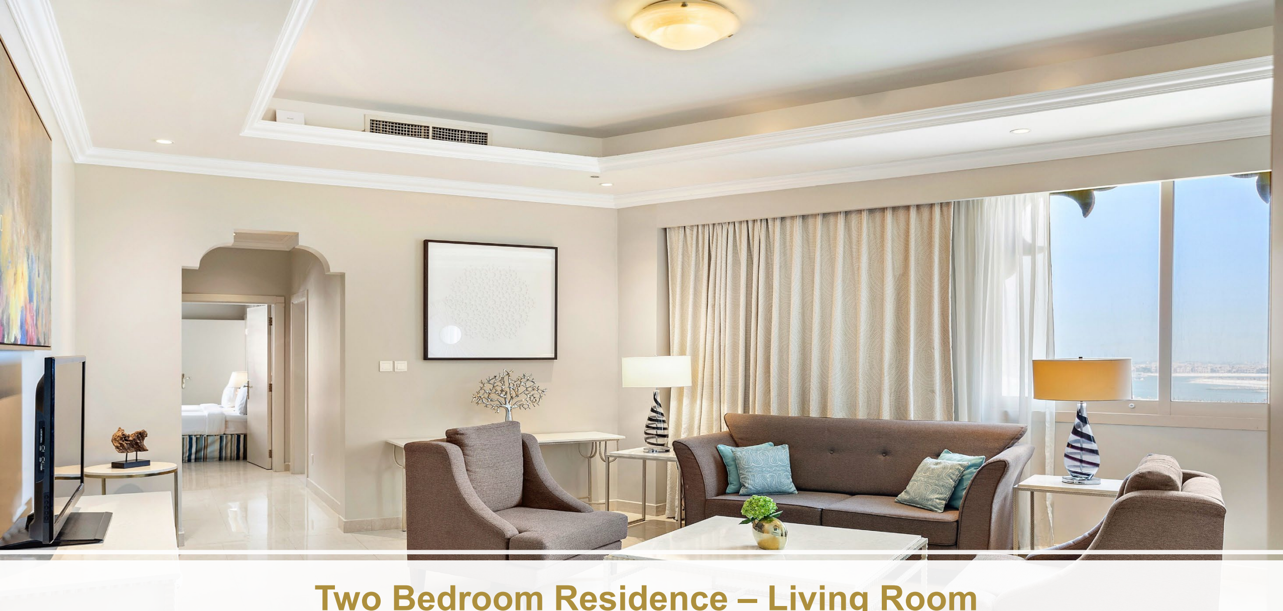
Two Bedroom Residence – Living Room