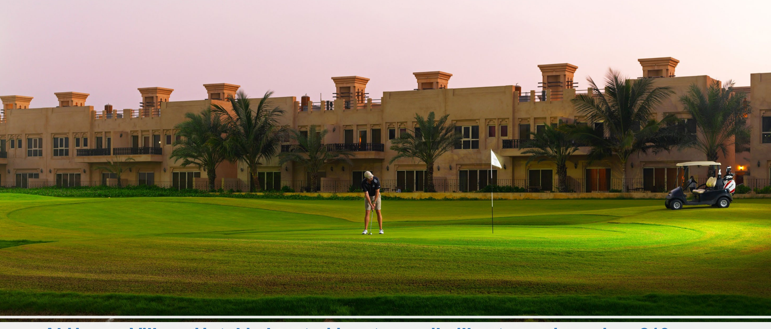
Al Hamra Village Hotel is located in a tranquil villa atmosphere, has 219 rooms and suites with breathtaking views of the golf course, pool, and garden.