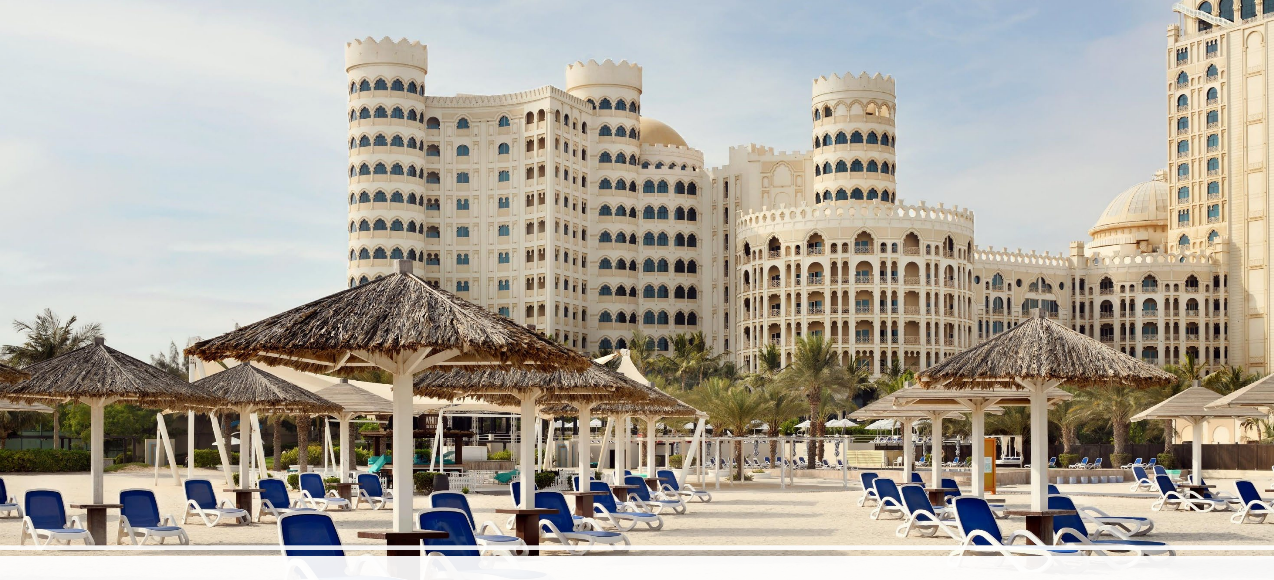
143 spacious Rooms and Suites with a picturesque view of the Arabian Sea